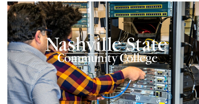
Do not place logo on a busy background image.