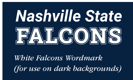
White Falcons Wordmark (for use on dark backgrounds)