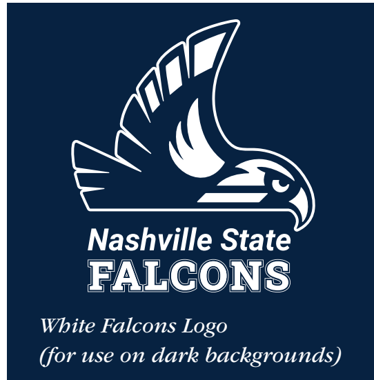
White Falcons Logo (for use on dark backgrounds)